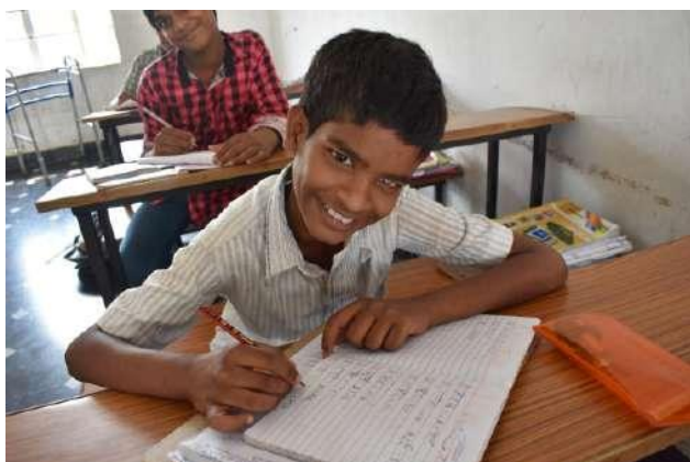
Children at Class rooms