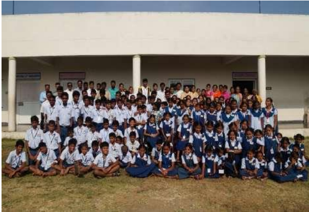
Children at School