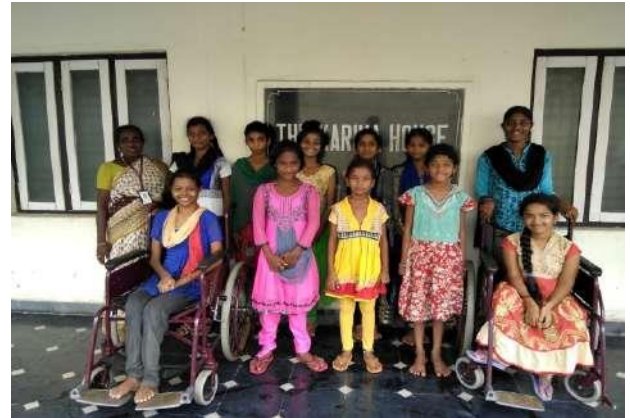
Children at Home