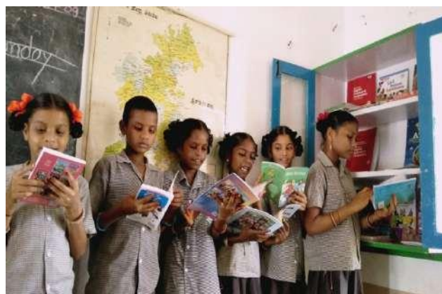
Children while using English Libraries