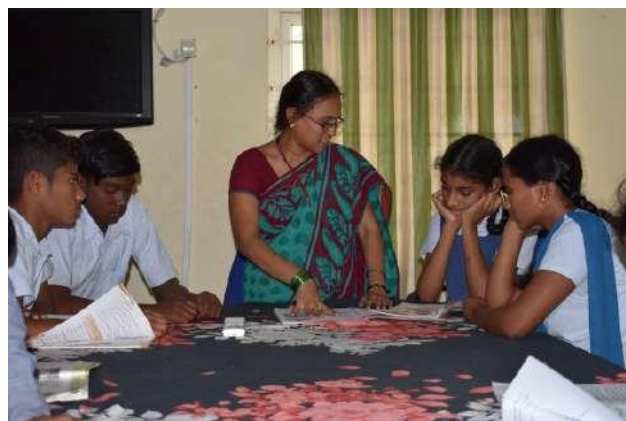
Children at School Library