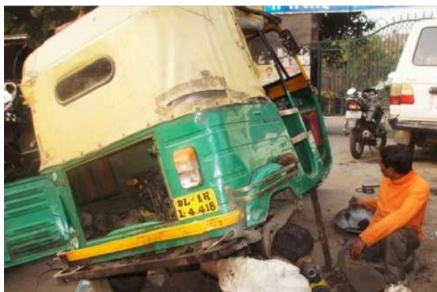
Tuk tuk work shop and repairs