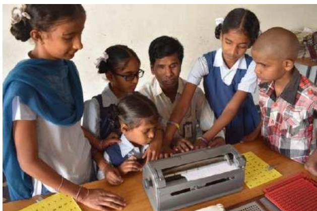
Children at Special class room