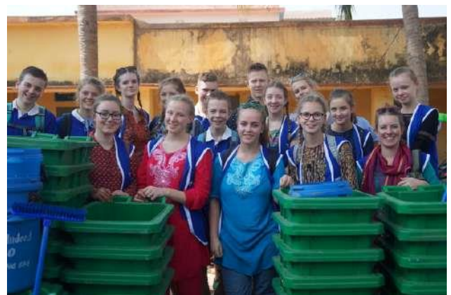
The Corlaer College team II 2017