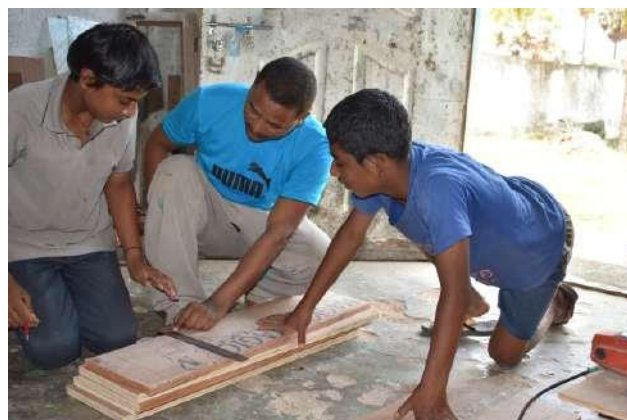
Youngsters learning Carpentry work