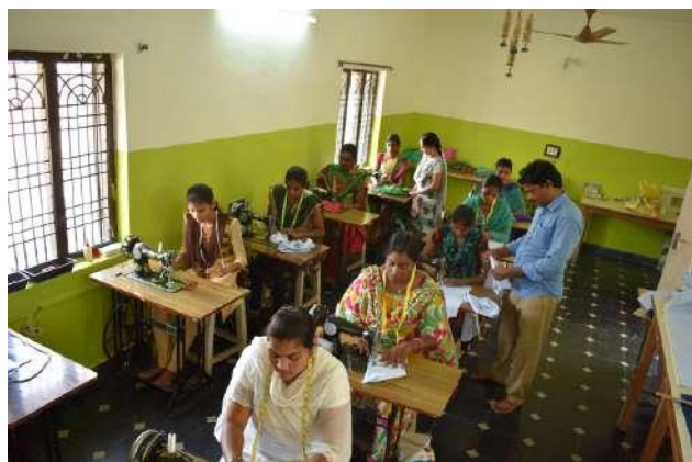
Youth girls at Stitching center

Our aim is to train the differently able youngsters in basic foundation courses like MS Office, Desktop publishing etc. During the year 2017, 9 differently abled youngsters have been trained in ICT and some of them got opportunities in nearby Industries.