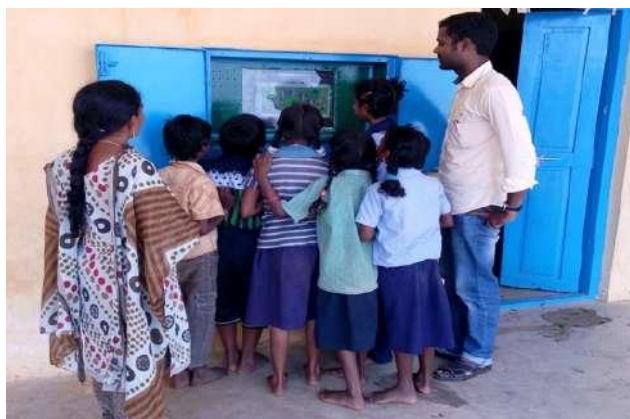
Children while using Child Tuition Software