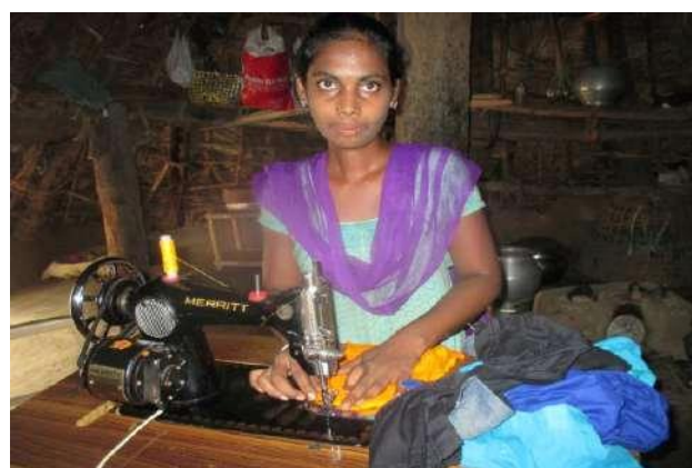
Youngster self employed at her village