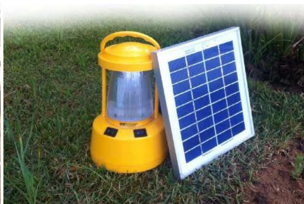
Portable solar panel and lanterns