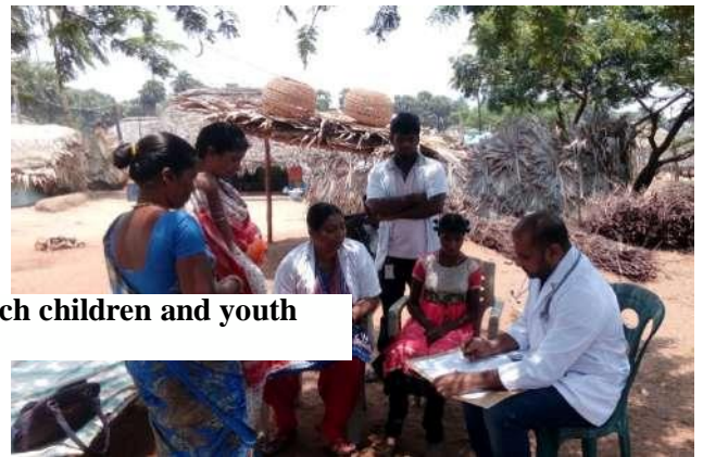
Doctor and Physiotherapy follow up at Outreach villages

our program. The children all belong to Fishing and Tribal communities.