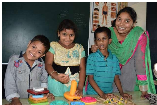
Children at ADL Training center

Campus also has Special Education, under the responsibility of the English Medium School. There are 3 teachers specially trained for the following children: