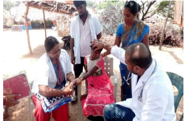
Physiotherapy follow up at Outreach

In 2017, 40 campus children and 160 persons from outreach, in total 200 persons are attending for physiotherapy at Campus itself. Also the medical team along with physiotherapist visits the villages once in a week to give physiotherapy at home. It is vital that children continue to do the exercises and the parents and their relatives also encourage them to do the physiotherapy at their home. Therefore, a booklet has been made for the parents, which includes pictures of all the exercises.